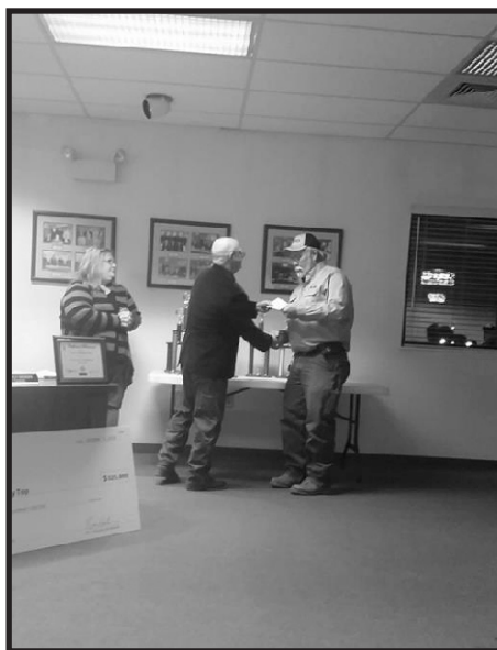
Powell-Clinch Utility District receiving their award for 3rd Place - Float Category