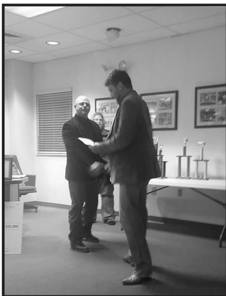
Rocky Top Worship receiving their award for 2nd Place - Float Category