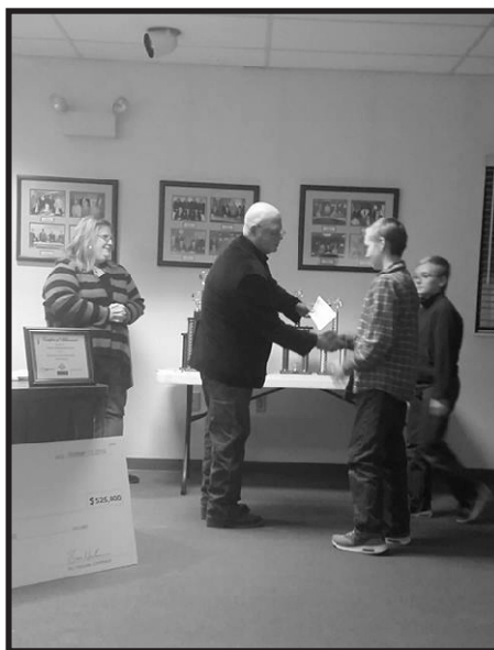
Sleepy-Eyed John's Music & Clogging receiving their award for 1st Place - Group Category