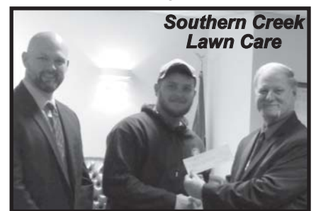
Southern Creek Lawn Care