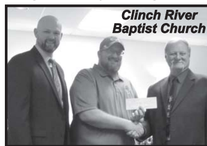
Clinch River Baptist Church