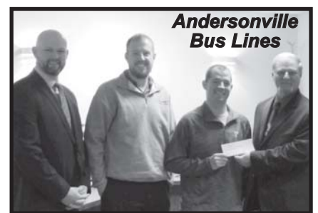
Andersonville Bus Lines