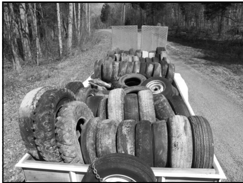
Tires picked up from Norris Shorelines

"Last year, we picked up over 15 tons of trash so we have seen a decline in the amount of trash on the shoreline and islands, but we have many problem areas where there is a reoccurring dumping year after year," said Graham.