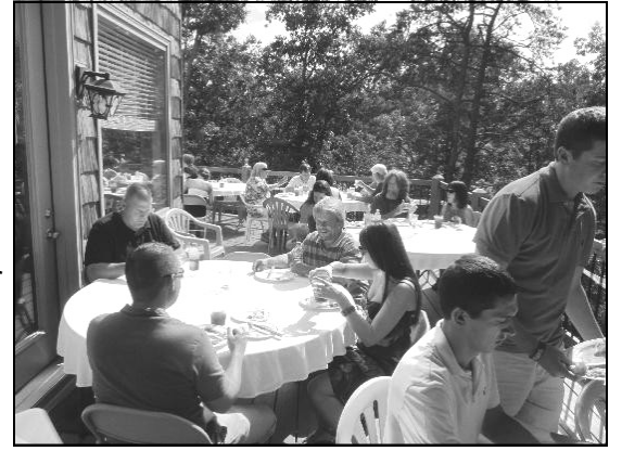
Back porch at Rickard Ridge BBQ

The next Lake City Chamber of Commerce's Networking Event will be a business after hours hosted by Rickard Ridge BBQ located at the Cove Lake State Park from 4 to 6 p.m.