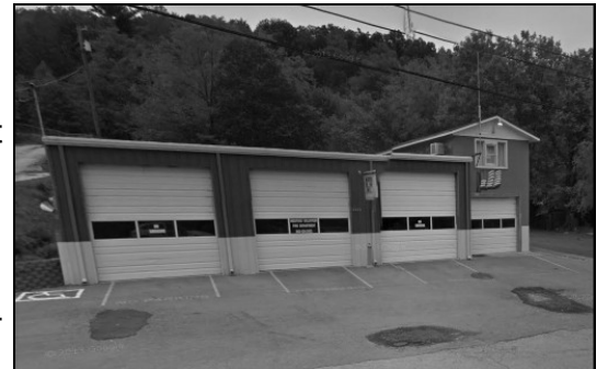
Medford Volunteer Fire Department

If you have any questions, please call 865-478-4697 or 865-426-2398.