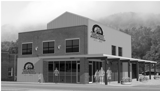
Drawing of proposed exterior of the new Coal Creek Miners Museum

If you would like to help with the fundraising effort, please join the board members at a meeting on February 11, 2014 at 6 p.m. at the Lake City Community Center. The sole purpose of the meeting will be to discuss the fundraiser.