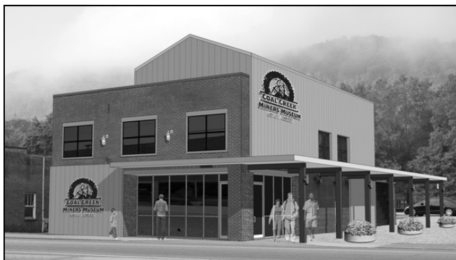
Drawing of proposed exterior of the new Coal Creek Miners Museum

preserve, honor, and promote the rich history of Coal Creek and the culture and economic heritage of all aspects of coal mining in East Tennessee utilizing education and outreach to foster economic and community development.