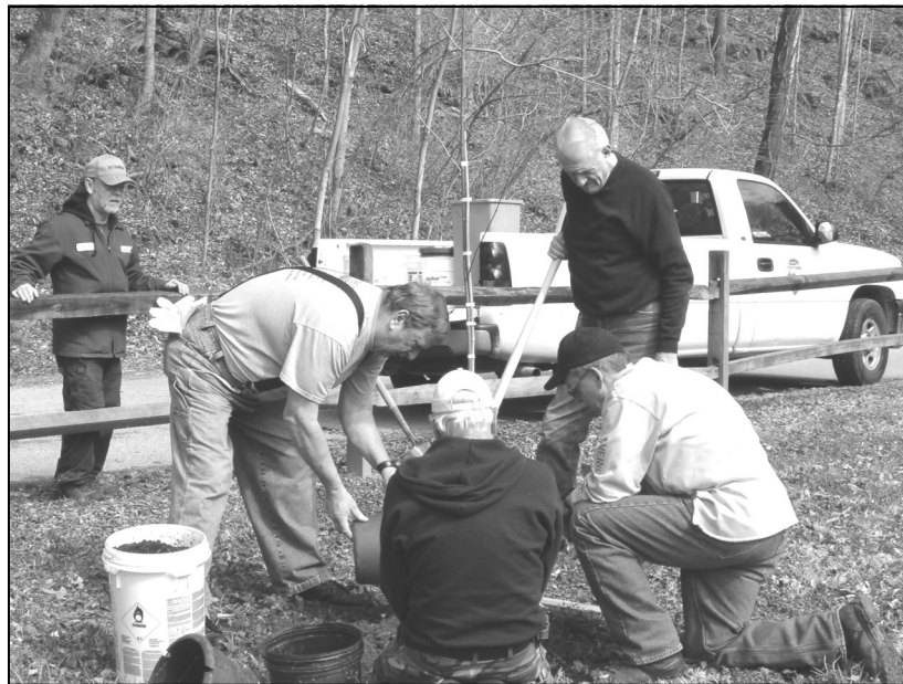
Friends of Norris Dam state Park planting trees at the park

Parks help us in so many ways, protecting wildlife, trees add oxygen to the air, recreational activities, a place to learn, so help them. Take care of state parks not only for people who visit them today, but also for people who will visit in ten years, twenty years, fifty years, and one-hundred years from now. Actions you take today will impact the future, make it a positive impact at your state park. Be an environmental steward. It is our responsibility to take care of the earth we live in and what enables us to live.