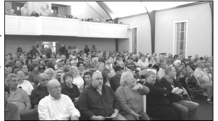
The Audience at the community meeting for Rocky Top on November 1, 2013

City council conducted a public meeting on Friday, November 1 st where residents were able to voice their opinion about the name change and the proposed development of several attractions throughout the Lake City area.