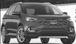
2021 FORD EDGE SEL AWD WITH POWER LIFTGATE (Stock #T6868)