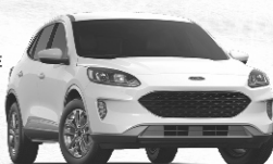
2021 FORD ESCAPE SE (Stock #T6865)