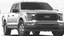
2021 FORD F150 4X4 SUPERCREW XLT WITH MAX TRAILER TOW PACKAGE (Stock #T6892)