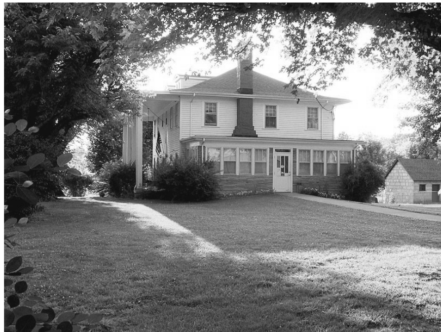
Sgt. Alvin C. York State Historic State Park

hiking, swimming, picnicking and interpretive programs. The park also features a popular area restaurant and separate recreation hall that can accommodate up to 250 people. If you’re a golfer, you’re in luck. The Bear Trace at Cumberland Mountain Golf Course is one of the most sought-after sites among the Jack Nicklaus designed Bear Trace courses in Tennessee. The 6,900-yard, par 72 layout features a design that capitalizes on