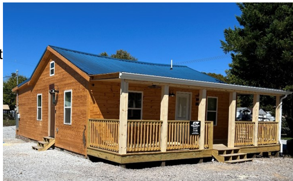
The Lodge After Renovation