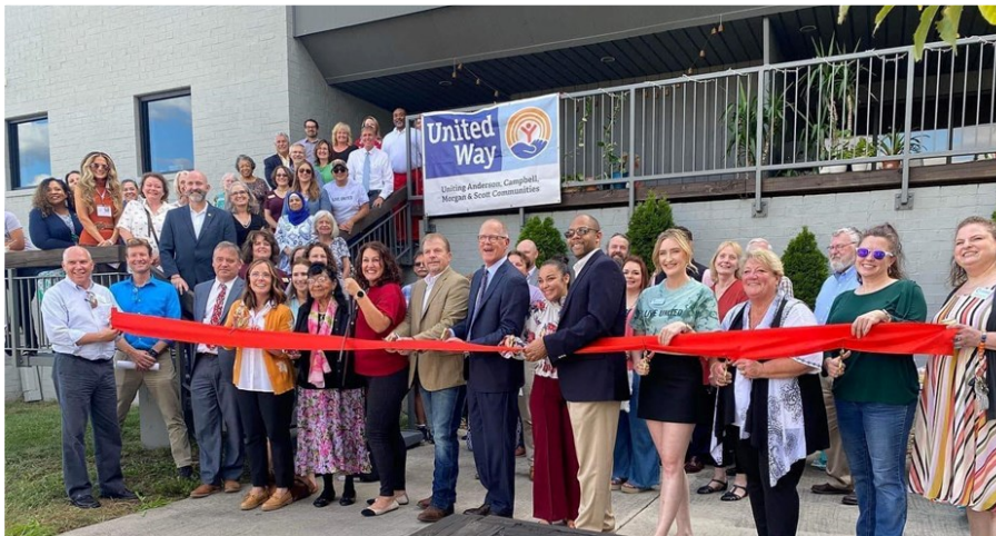
Ribbon Cutting at United Way's new Oak Ridge location in the fall of 2022