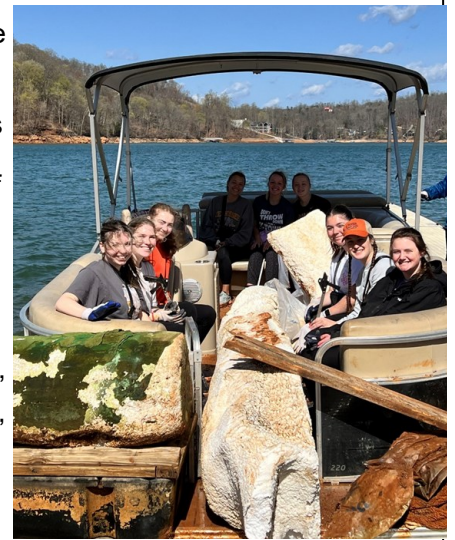
Norris Lake, continued on page 3