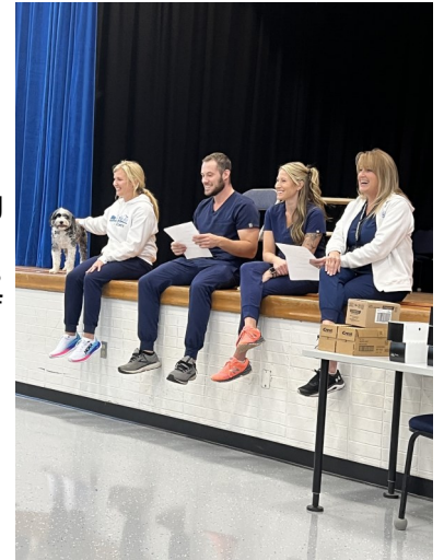
Staff from Rocky Top Dentistry

The program was a huge success, with students expressing gratitude for the chance to connect with professionals in their fields of interest. Many of the students stated that they had gained a better understanding of what it takes to succeed in their