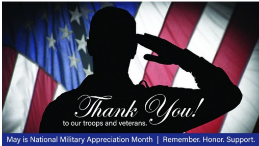
May is National Military Appreciation Month | Remember. Honor. Support.

May is National Military Appreciation Month, a time to honor and celebrate the contributions of our military personnel and their families. This month-