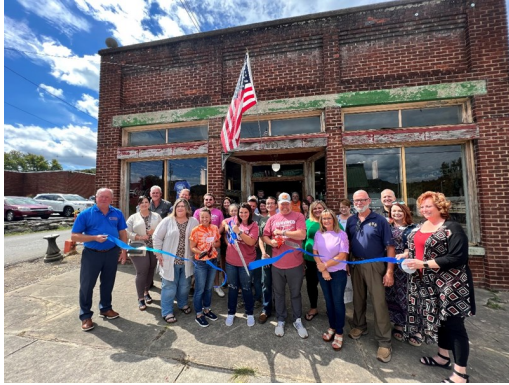
The Rocky Top Chamber and Anderson County Chamber welcomed Coal Creek General Store to Rocky Top with a Ribbon Cutting on September 25th.